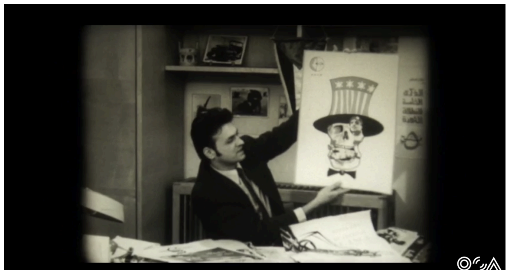
Still from Guerilla Fighters in Jordan ( Gerillatüzek Jordániában , 1971. HU OSA 424-0-1-059 Soviet Propaganda Film Collection