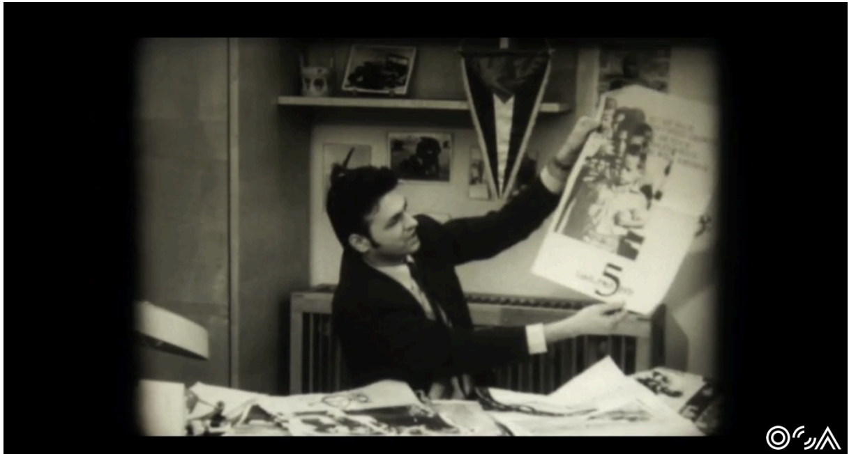
Still from Guerilla Fighters in Jordan ( Gerillatüzek Jordániában, 1971.