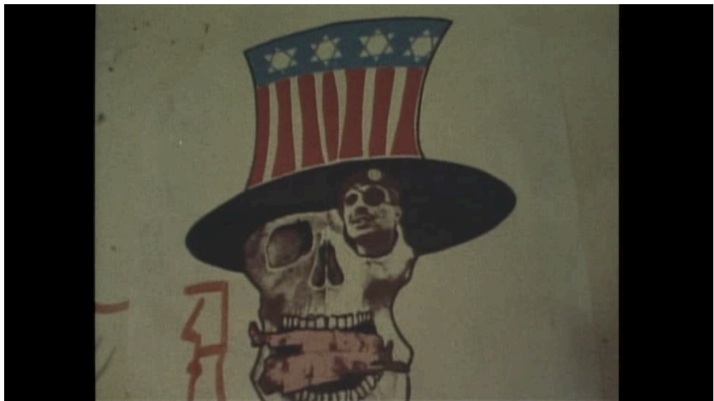
Still from Red Army/PFLP: Declaration of World War , dir. Masao Adachi and Koji Wakamatsu, 1971

Masao Adachi and Koji Wakamatsu, in accordance with the radical-militant leftist position of the JRA and the PFLP, advocated in Declaration of World War for the internationalization of armed struggle—“world war”—“as the best form of propaganda” 11 —in sharp contrast to the Hungarian film’s favored position of political resolution. Interestingly, however, the same PFLP poster appears in both films.