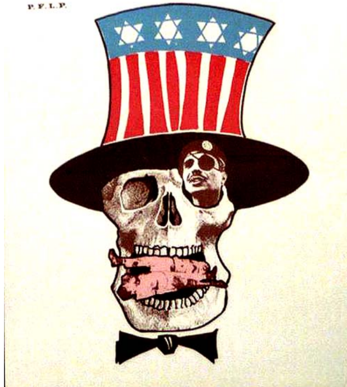
“Triple Threat – 1.” Publisher: Popular Front for the Liberation of Palestine (PFLP), circa 1970, Source: The Palestine Poster Project Archives, https://www.palestineposterproject.org/poster/triple-threat-1

As Nadia Yaqub highlights, after 1948, for two decades, Palestinians had very little access to film and photography, and thus had no control over their own representation; they were seen and represented by others. 12 It was in the late 1960s, when Mustafa Abu Ali and the PFU started Palestinian militant filmmaking as documentation and as integral part of the revolution, the audience of which were the Palestinians. 13 Moreover, as Mohanad Yaqubi likewise accentuated in relation to his film project Off Frame AKA Revolution Until Victory , militant films of this era marked also a turning point in Palestinian’s identity: from refugee to freedom fighter. 14