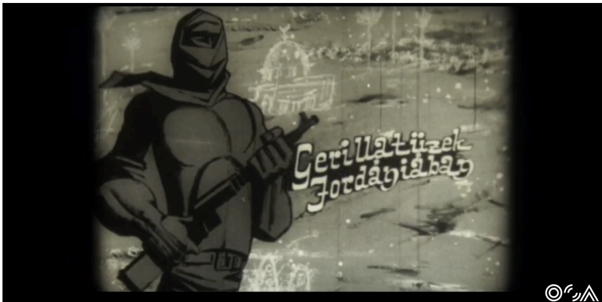
Still from Guerilla Fighters in Jordan ( Gerillatűzek Jordániában , 1971. HU OSA 424-0-1-059 Soviet Propaganda Film Collection