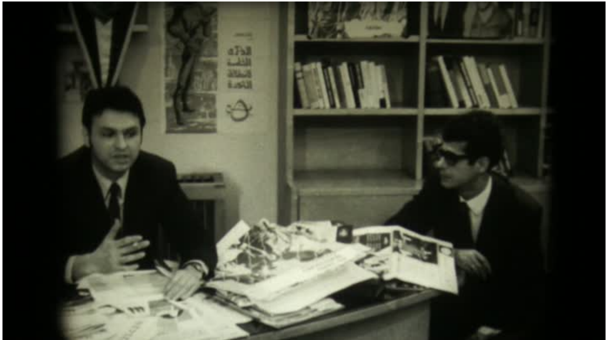
Still from Guerilla Fighters in Jordan ( Gerillatűzek Jordániában , 1971. HU OSA 424-0-1-059 Soviet Propaganda Film Collection)

During my Visegrad Scholarship at the Vera and Donald Blinken Open Society Archives, my point of departure was a Hungarian film, Guerilla Fighters in Jordan ( Gerillatűzek Jordániában , 1971. HU OSA 424-0-1-059 Soviet Propaganda Film Collection), which puts forth Hungary's state-propagated solidarity with Palestine. With studying Guerilla Fighters in Jordan as a case study, my aim was to understand how the ideology presented in this 1971 film fits the trajectories of both international and Hungarian history. My objective overall was to ground my current research as a contemporary art curator on global solidarity and Second World – Third World relations during the Cold War in more historical-academic terms. My research at OSA was thus twofold: on the one hand, to contextualize internationally a Hungarian piece of the Soviet Propaganda Film Collection at OSA; on the other hand, to reconstruct with archival materials of OSA Holdings the local and global historical contexts in which this Hungarian film emerged in 1971.