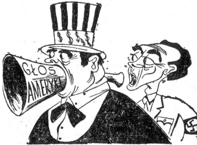
Figure 1. The inscription on the loudspeaker reads “Voice of America”