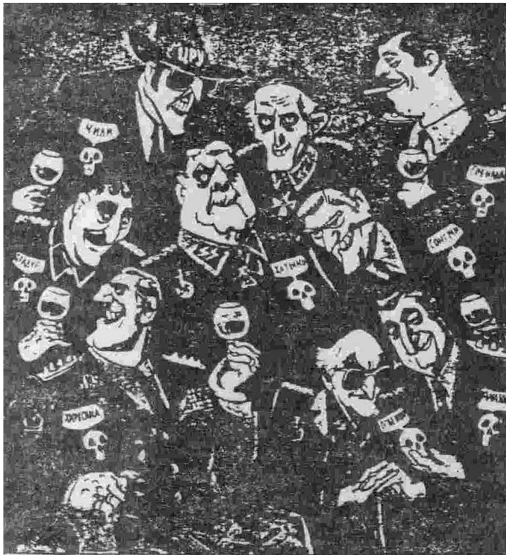
Figure 2. “Here’s to our mutual understanding and cooperation, colleagues!”